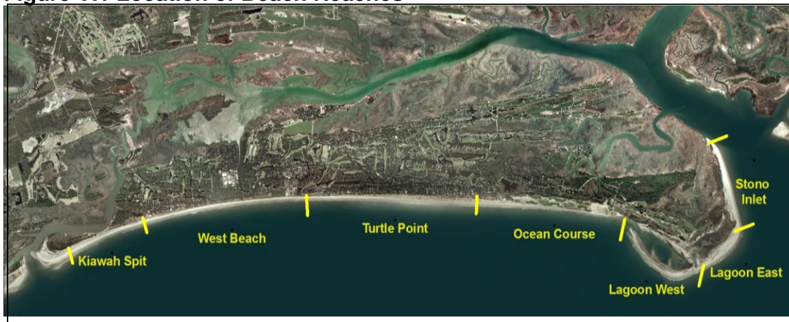
Figure V.1 Location of Beach Reaches

The beach and dune system is currently judged to be in excellent condition and is monitored annually. The beach is divided into seven reaches or zones (Figure V.1) and annual erosion and accretion rates are calculated each year. This is done by conducting beach profile monitoring at 86 locations along the beachfront. Between 2008 and 2009, all reaches accreted sand with the exception of the Stono Inlet reach. The Stono Inlet area is very dynamic due to its location along the Stono River. This reach is not adjacent to any homes or structures.