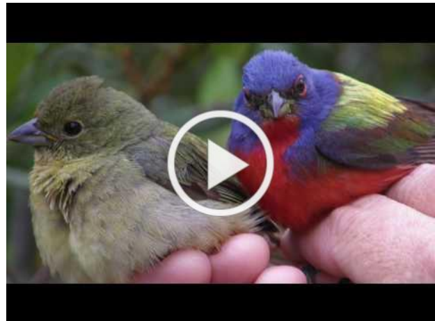
Wild About Painted Buntings