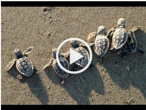
Sea Turtle Part 2 Hatching